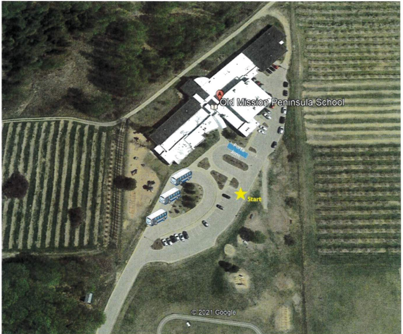
Start set up at Old Mission Peninsula School.

The start location will be at Old Mission Peninsula School. The race course will then proceed south to Island View Rd. turning West to then run through Island View Orchards. Runners will head North all the way to Devils Dive Rd where they will then head West to connect to Peninsula Dr. following it all the way into town (same course as in years previous down to Traverse City).